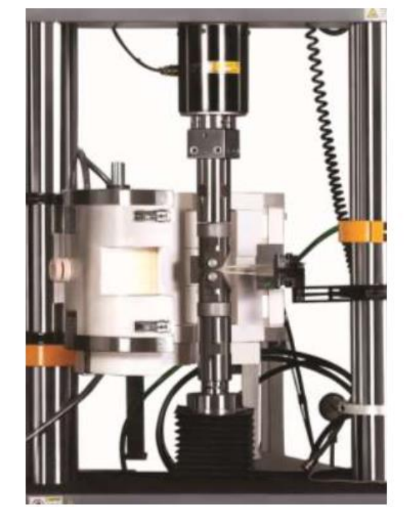
Split type furnace for testing up to 1200°C