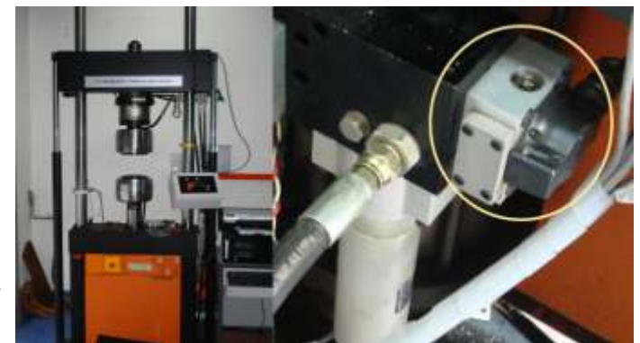
100kN UTM – Instron