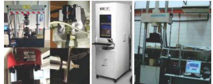
100kN UTM – Zwick Roell